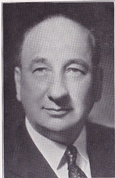
BISHOP E. L. WALDORF Bishop of the Chicago Area of the Methodist Church