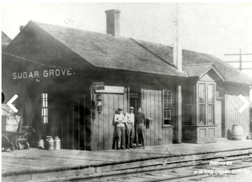
Sugar Grove Train Depot, circa 1915.