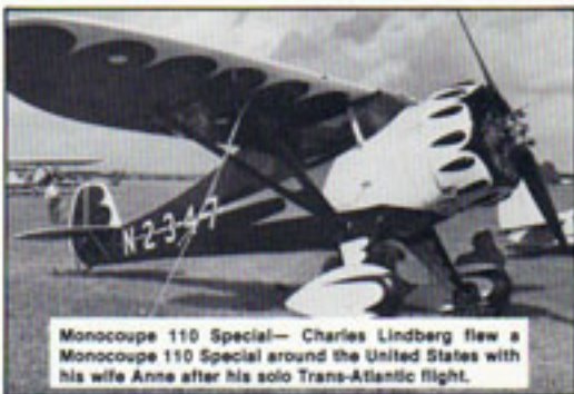
Monocoupe 110 Special— Charles Lindberg flew a Monocoupe 110 Special around the United States with his wife Anne after his solo Trans-Atlantic flight.