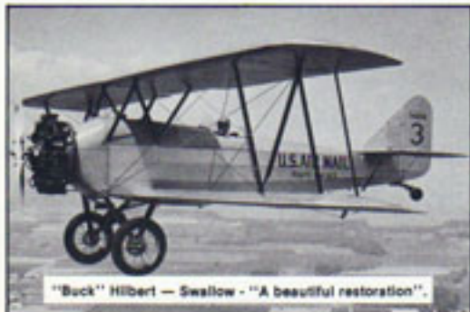
"Buck" Hilbert — Swallow — "A beautiful restoration".