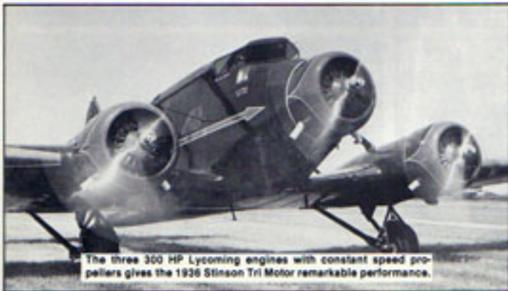
The three 300 HP Lycoming engines with constant speed propellers gives the 1936 Stinson Tri Motor remarkable performance.