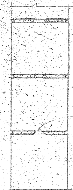
MORTAR JOINTS IN HAYDITE FOR EXTERIOR WALLS